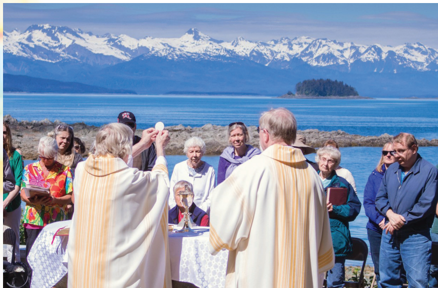
Memorial Day Mass celebrated outdoors at the National Shrine of St. Thérèse in Juneau, AK.